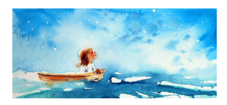
"Nothing great was ever achieved without enthusiasm." -- Ralph Waldo Emerson

Wouldn't it be ideal if we could isolate one trait in our personalities, capture it in a glass for observation and dissection? Of course this is not possible. Neither is it possible for us to isolate one part of a birth chart. The different aspects of our children's birth charts intermingle in a complex manner to make the little person that we know and love. However, it is possible for us to influence the development of our children, to support them in their journey. The aim of this section is to give vital clues for parents and mentors on how to guide, but not coerce, the development of your child.